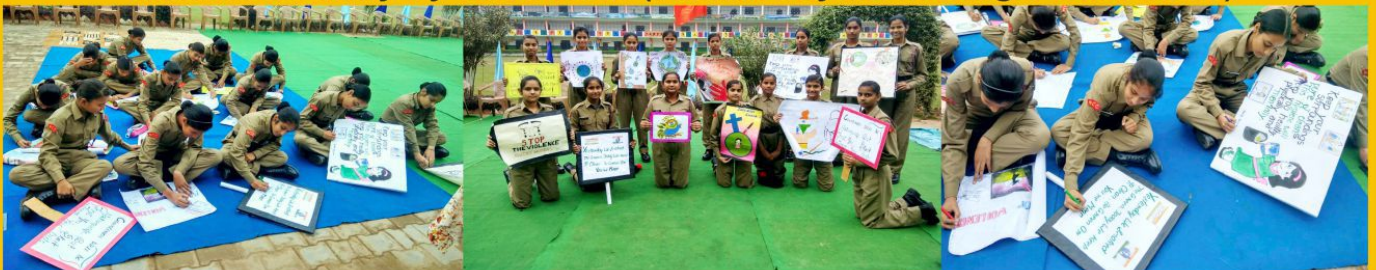
Participation In Poster Making Competition (Theme: Clean City Green City)

A group of 25 students participated in Model United Nations held at Amity University. The students were enthralled to be a part of an extravagant platform for debating International issues, drafting resolutions to combat issues, and to socialize. Its experience created a life time memory for all the young participants.