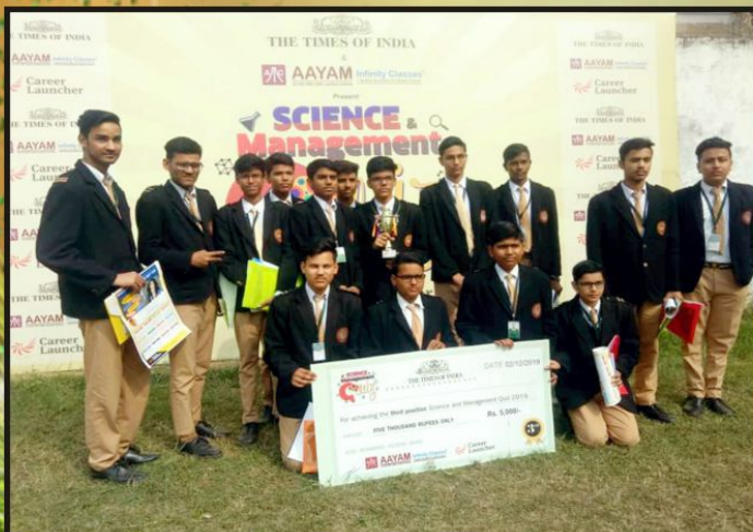
Team Winning 2nd position in the Science & Management Quiz organized by The Times of India Group