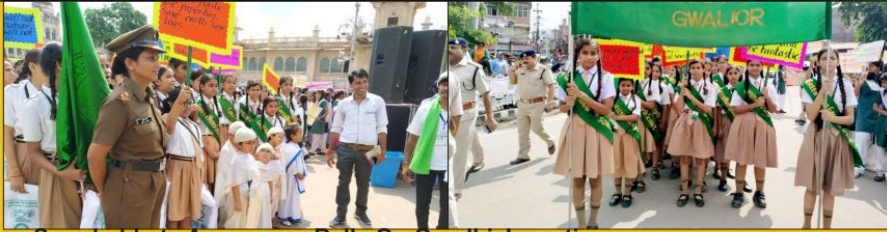
Swachhata Awareness Rally On Gandhi Jayanti