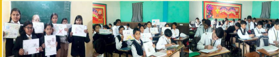
Poster Making Activity (Theme : Plastic A Threat To Human Life)