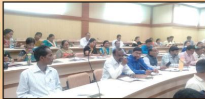
Participation In Globe Programme By Ministry of Environment & Water Resources At Bhopal