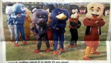
स्कूल में आयोजित कार्यक्रमों के एक प्रसंगी दृश्य (संवादक)