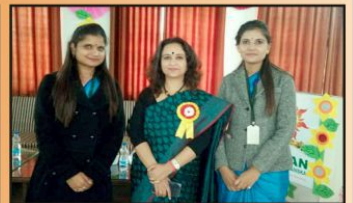
Participation In Workshop On Khelo India By Coe, Ajmer