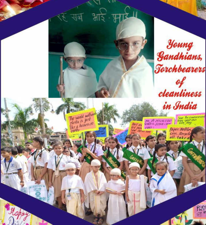
Young Gandhians, Torchbearers of cleanliness in India