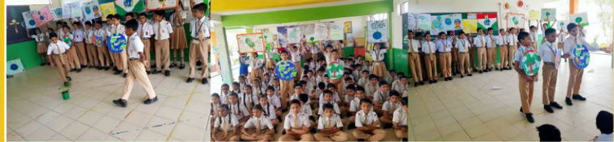
Special Assembly on Earth Day