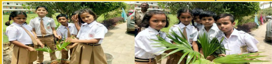
Plantation by Classes I-III