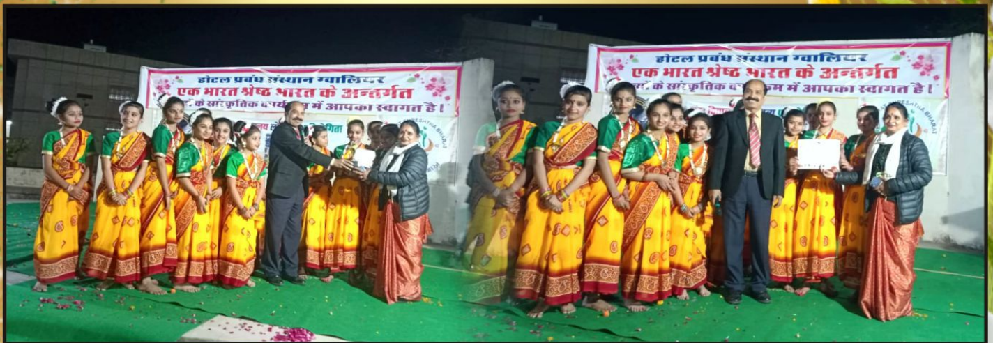
Team Winning 2nd Position in the Inter School Folk Dance Competition Held at IHM