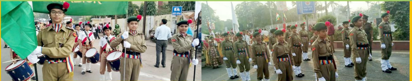
Awareness Rally By The Cadets (Theme: Say No To Single Use Plastic)