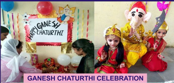
GANESH CHATURTHI CELEBRATION