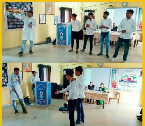
Nukkad Natak Under Swachhata Campaign By Students From IHM

"One touch of nature makes the whole world kin."