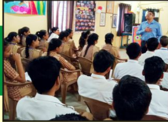
Career Counseling Workshop for class XII by Akash Institute