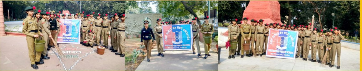
Cleanliness Drive At Laxmi Bai Samadhi Under Swachh Bharat And Swasth Bharat Mission By The Cadets