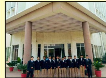
Workshop on Career in Hospitality at IHM