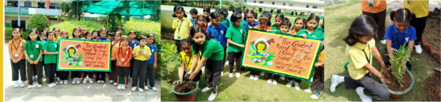
Plantation By Classes IV-V