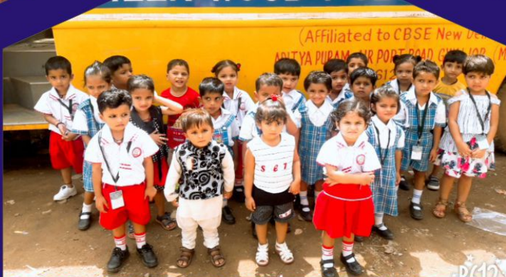
VISIT TO VEGETABLE & FRUIT MARKET