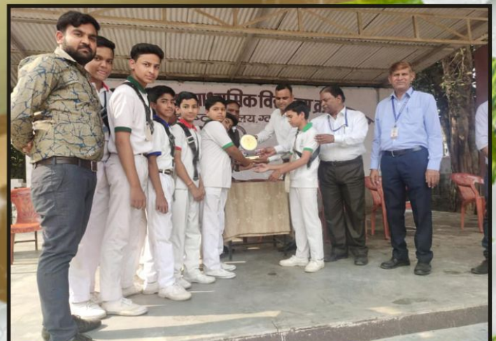
Team Winning 2nd position in the Interschool Band Competition