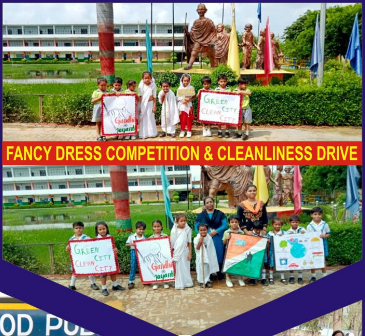
FANCY DRESS COMPETITION & CLEANLINESS DRIVE