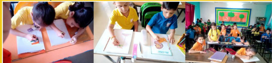
Poster Making Competition For Classes III-IV (Theme : Save Earth, Save Environment)