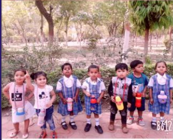
VISIT TO SUN TEMPLE