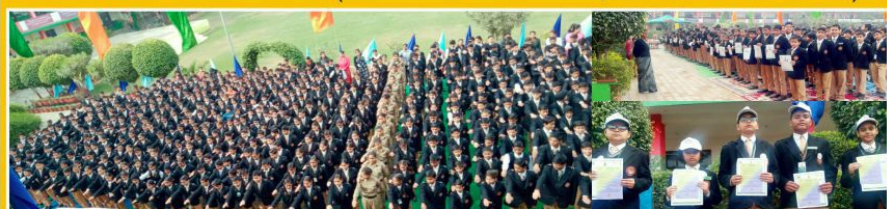
Swachhata Ambassadors Taking Pledge For Plastic Free Gwalior

To sensitize the students towards the environment and motivate them to become conscientious citizens, a plethora of activities were organized by our Eco Club. Such activities enlightened the students about the significance of planting trees, protecting and conserving the environment and safeguarding the environment, thus enabling all to move towards a greener tomorrow.