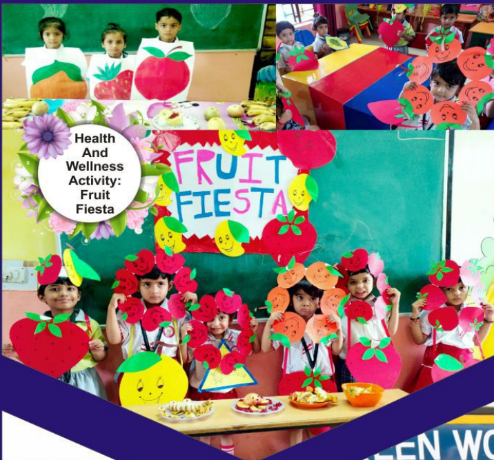
Health And Wellness Activity: Fruit Fiesta