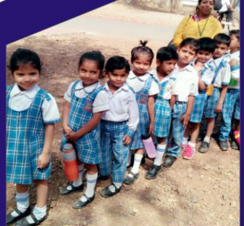
VISIT TO SUN TEMPLE