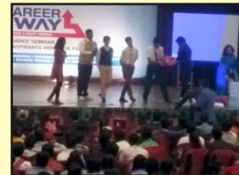
Participation in Workshop on Career Guidance at SRM