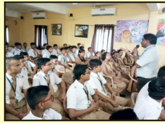
Career Counseling Workshop for class XII by Experts from Delhi