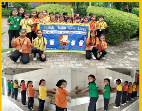
Handwash Activity By Classes III-IV