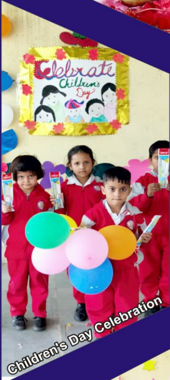
Children's Day Celebration