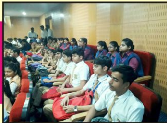
Participation in International Conference at Amity University (Class XII)