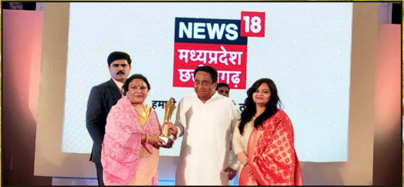
Our Director, Receiving The Prestigious "Visionary Leadership in Education Award" By Hon'ble Chief Minister of Madhya Pradesh - Shri. Kamal Nath Ji On 14.08.2019